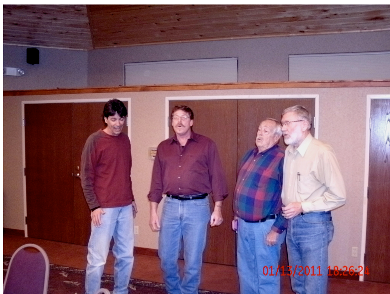
Fourmata singing for their supper