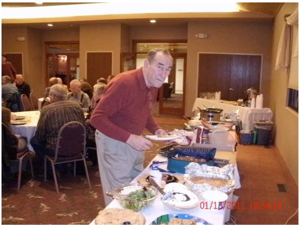
I don't see anything wrong with seconds. Seconds just mean the firsts was not enough. So quite taking pictures.