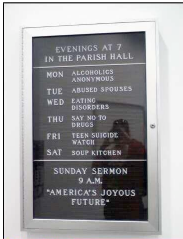
FRIENDS OF IRONY

When all else fails, try singing BARBERSHOP