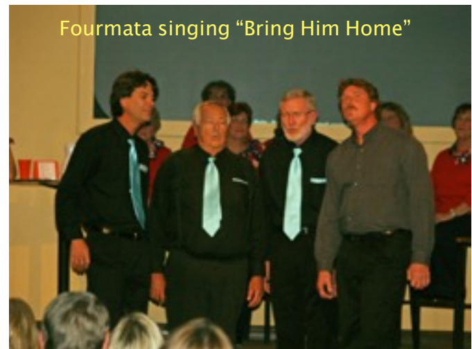
Fourmata singing "Bring Him Home"

The afterglow, held in the same large Delta Christian Church auditorium as the show, went very well. Everyone had their opportunity to trash what ever was left of their vocal chords while scarfing the lady-prepared finger foods. One of the vocal treats was an appearance of a no-longer