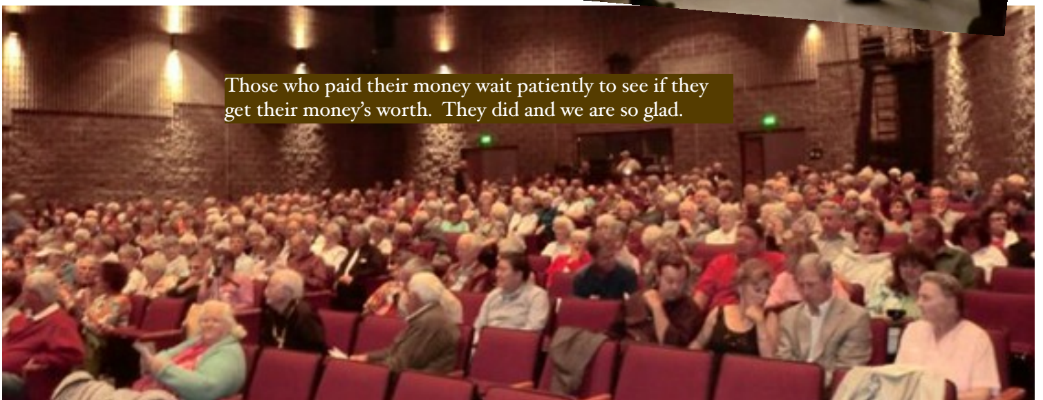
Those who paid their money wait patiently to see if they get their money's worth. They did and we are so glad.