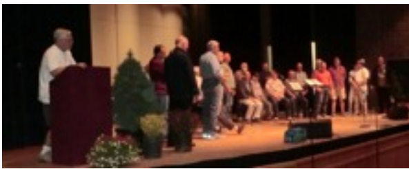
Semi-formal dress rehearsal on Saturday afternoon.