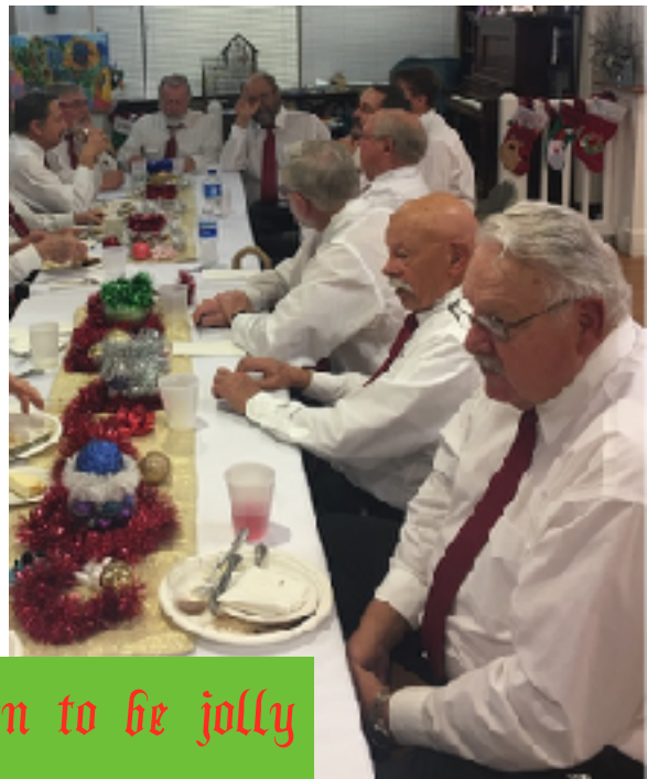
'Tis the season to be jolly