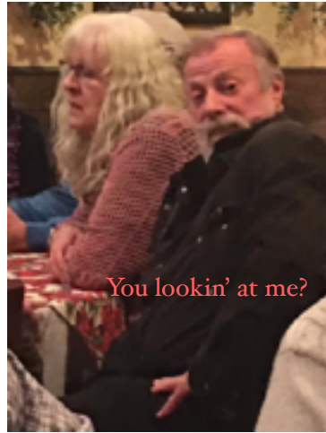
You lookin' at me?