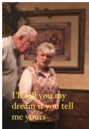
I'll tell you my dream if you tell me yours