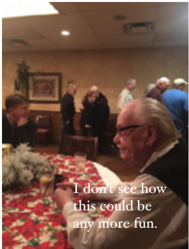
I don't see how this could be any more fun.