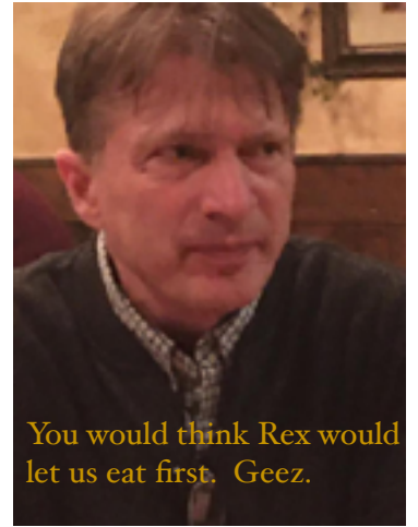
You would think Rex would let us eat first. Geez.